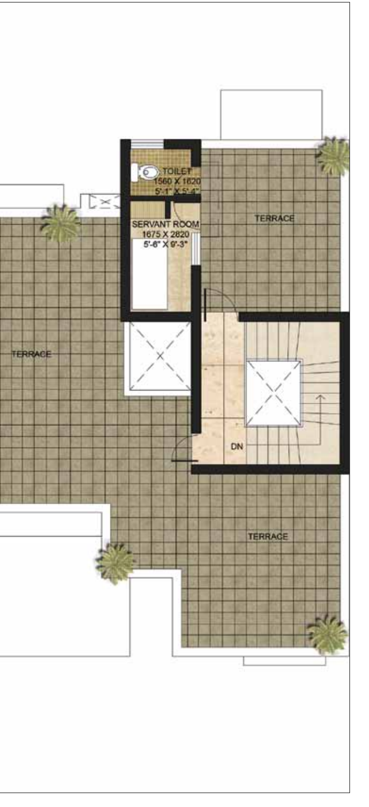
Second Floor 25.47 sq. mt. (274 sq. ft.)

Super Area = 258.09 sq. mt. (2778 sq. ft.) Terrace = 17.78 sq. mt. (191 sq. ft.)