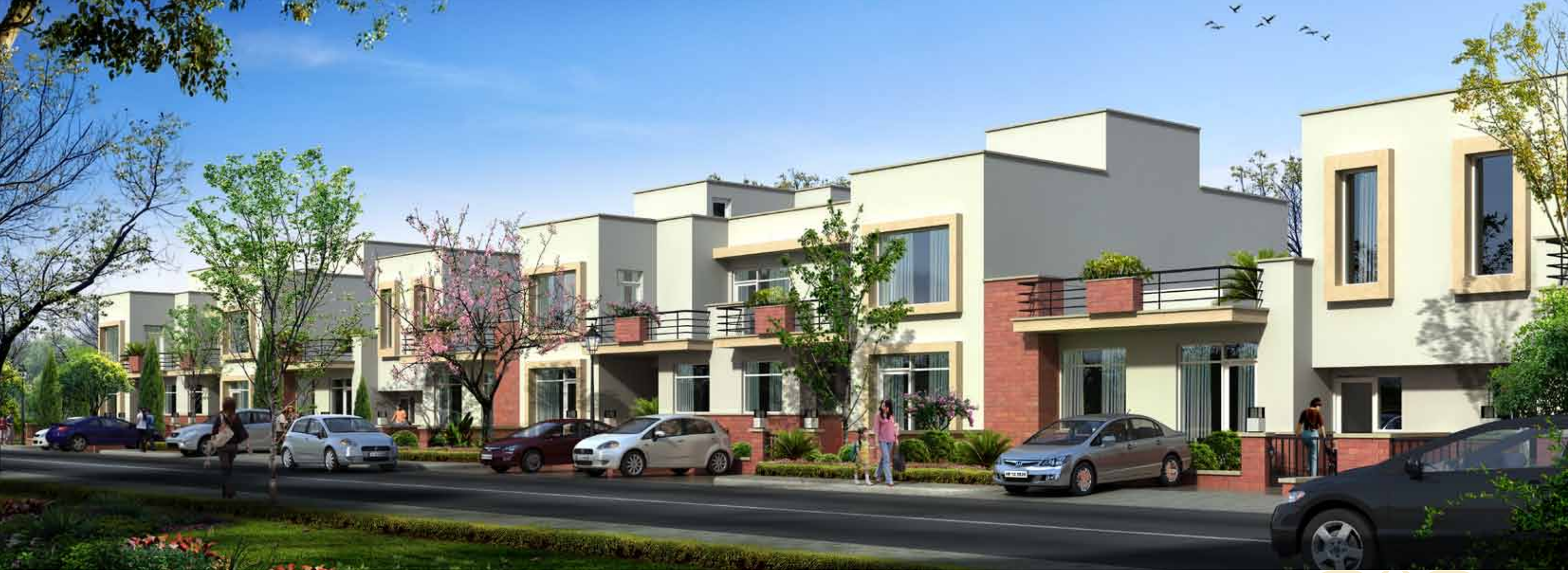
This is an artist's rendition and may undergo modifications.