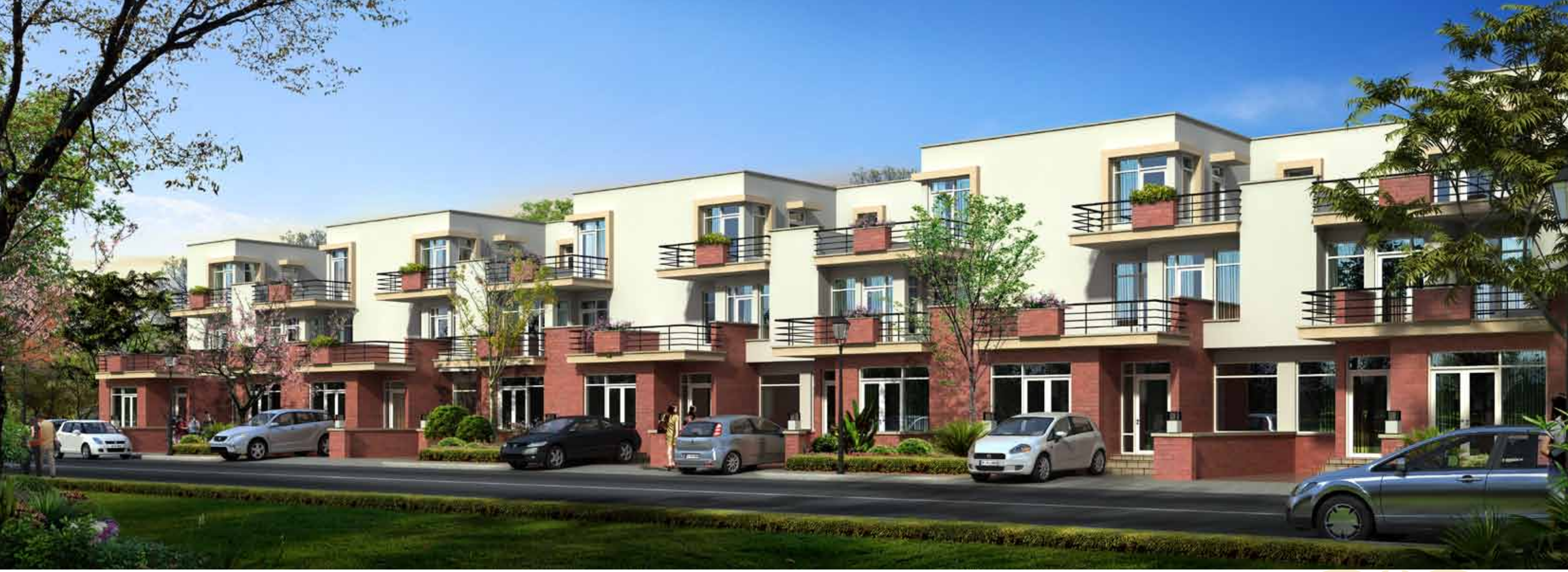
This is an artist's rendition and may undergo modifications.