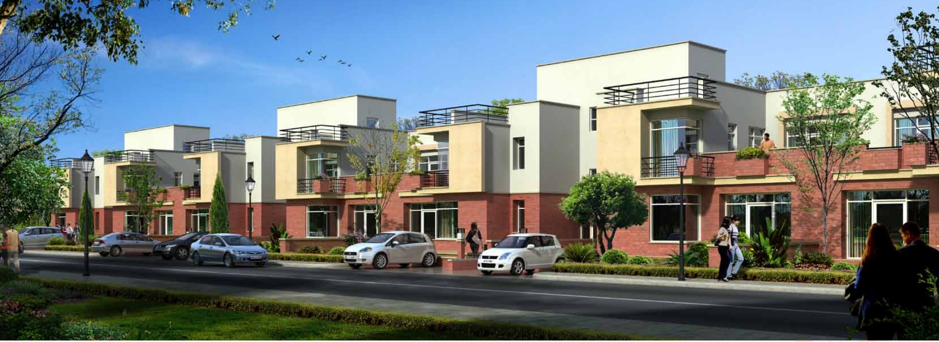
This is an artist's rendition and may undergo modifications.