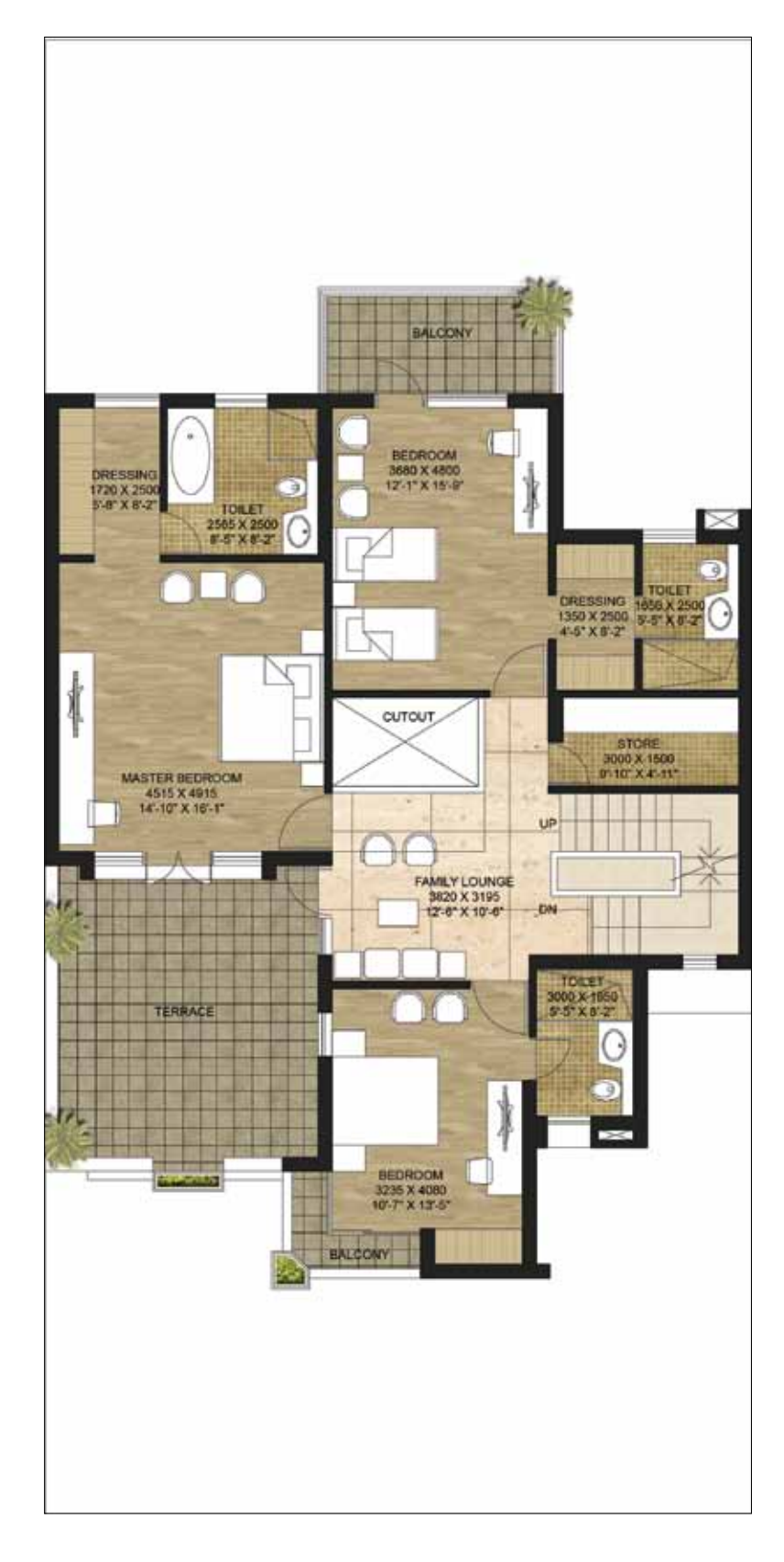
Ground Floor 165.678 sq. mt. (1783 sq. ft.)