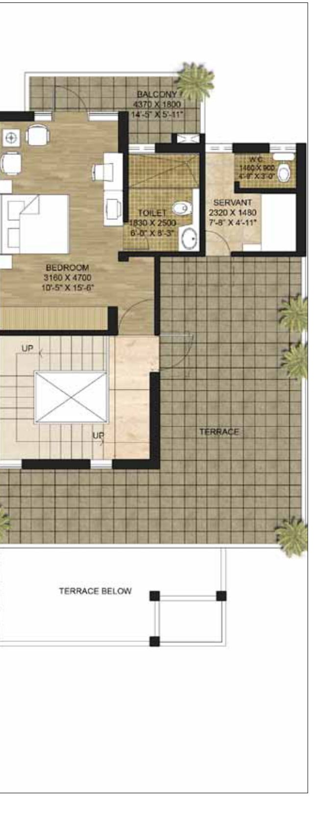
Second Floor 54.76 sq. mt. (589 sq. ft.)

Super Area = 245.86 sq. mt. (2646 sq. ft.) Terrace = 11.22 sq. mt. (121 sq. ft.)