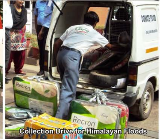
Collection Drive for Himalayan Floods