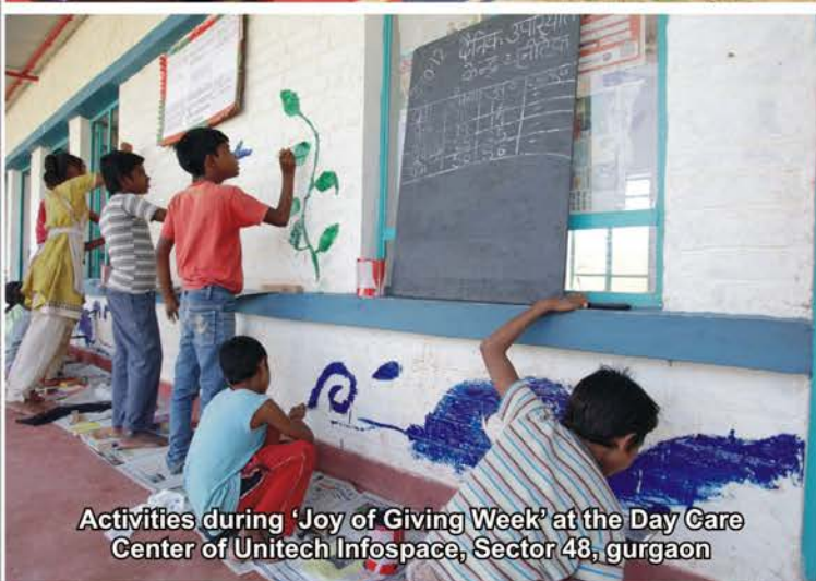
Activities during 'Joy of Giving Week' at the Day Care Center of Unitech Infospace, Sector 48, gurgaon