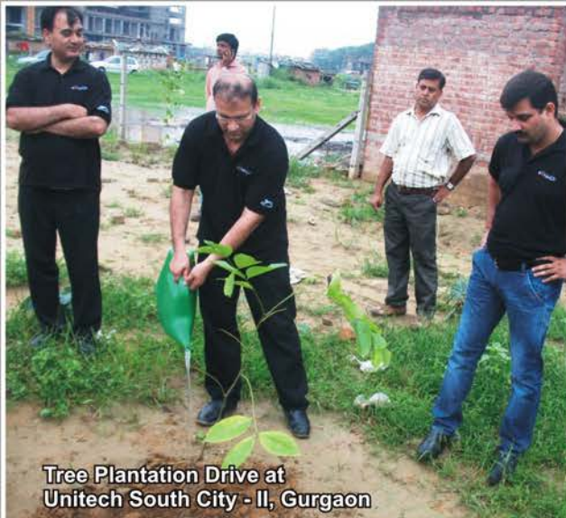
Tree Plantation Drive at Unitech South City - II, Gurgaon