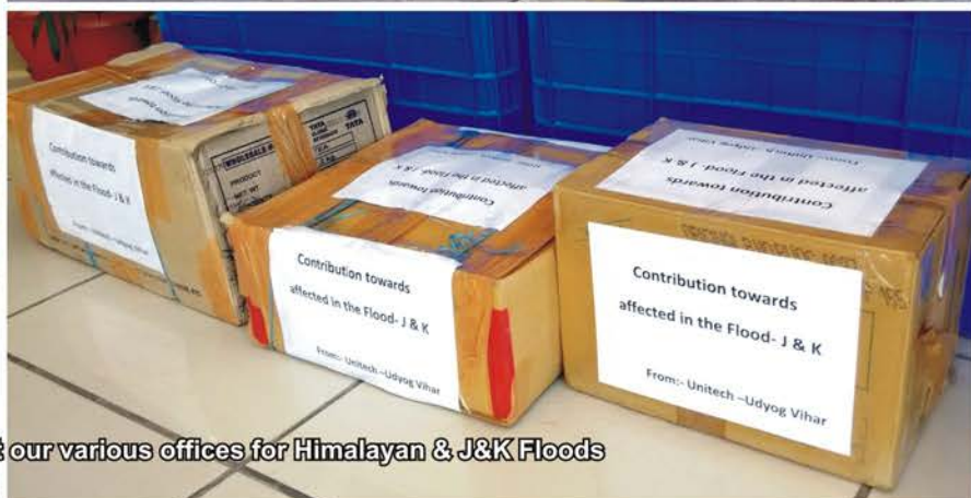
Collection Drives conducted at our various offices for Himalayan & J&K Floods