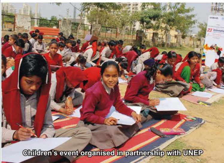
Children's event organised in partnership with UNEP

Blood Donation Camp at Signature Towers, Gurgaon - On the occasion of 'World Health Day', we organized a blood donation camp at Unitech Signature Towers, Gurgaon in association with Lion's Club. The health day is celebrated on 7 April every year to mark the anniversary of the foundation of WHO in 1948.