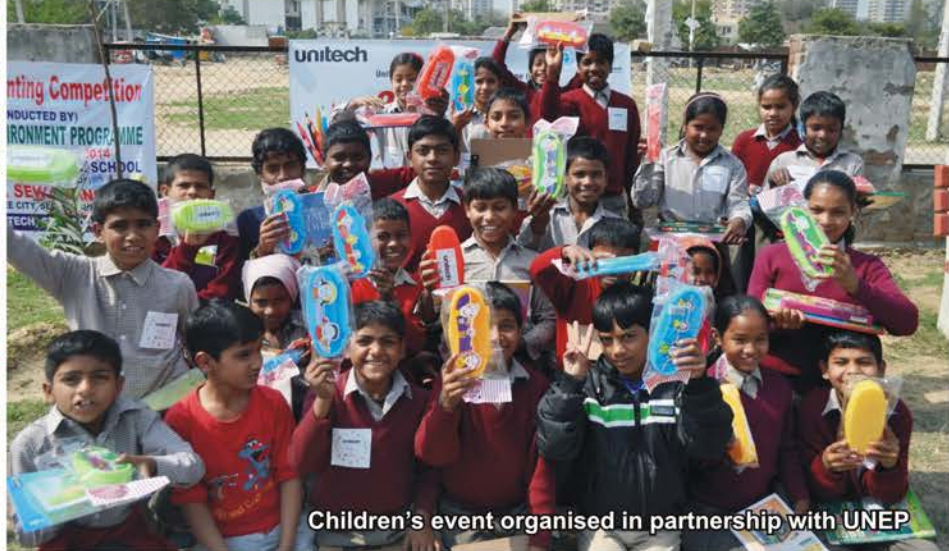
Children's event organised in partnership with UNEP