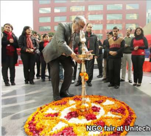
NGO fair at Unitech Cyber Park, Gurgaon