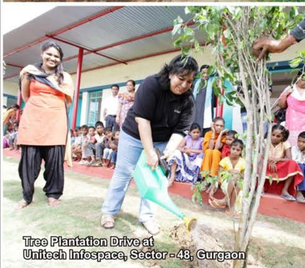
Tree Plantation Drive at Unitech Infospace, Sector - 48, Gurgaon