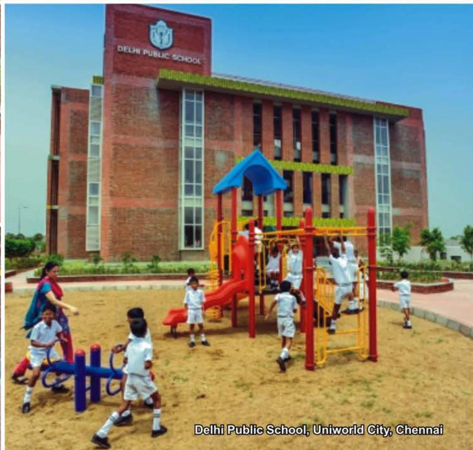
Delhi Public School, Uniworld City, Chennai