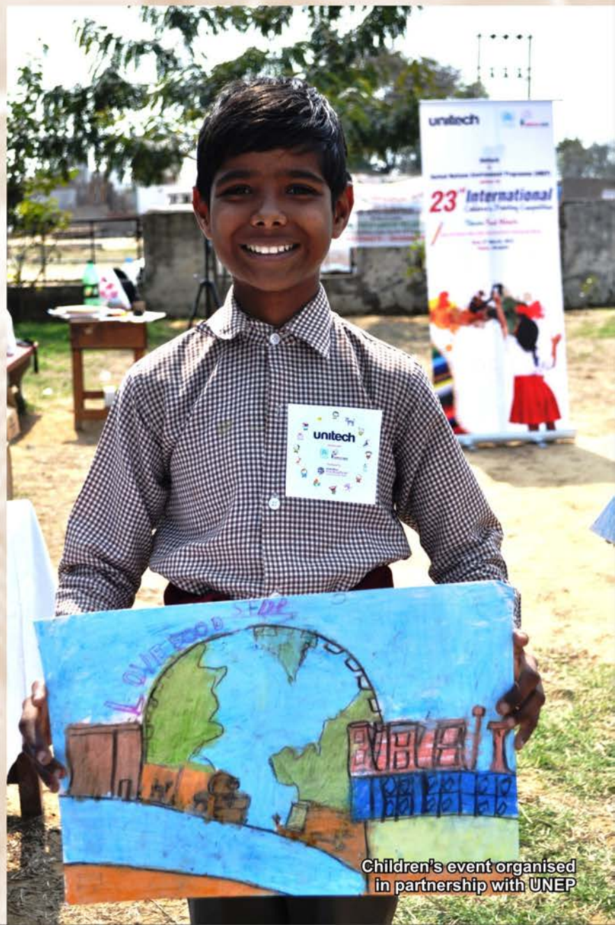
Children's event organised in partnership with UNEP

Over the years, Unitech has been actualizing various activities in order to contribute to society, where we live and work. The Company conducts its business in a way that creates social, environmental and economic benefits to the communities with regards to education, community welfare, rainwater harvesting, energy-efficient buildings and social forestry. Unitech has been earnest for contributing towards the betterment of the society through various welfare initiatives and skill building trainings to empower the communities.