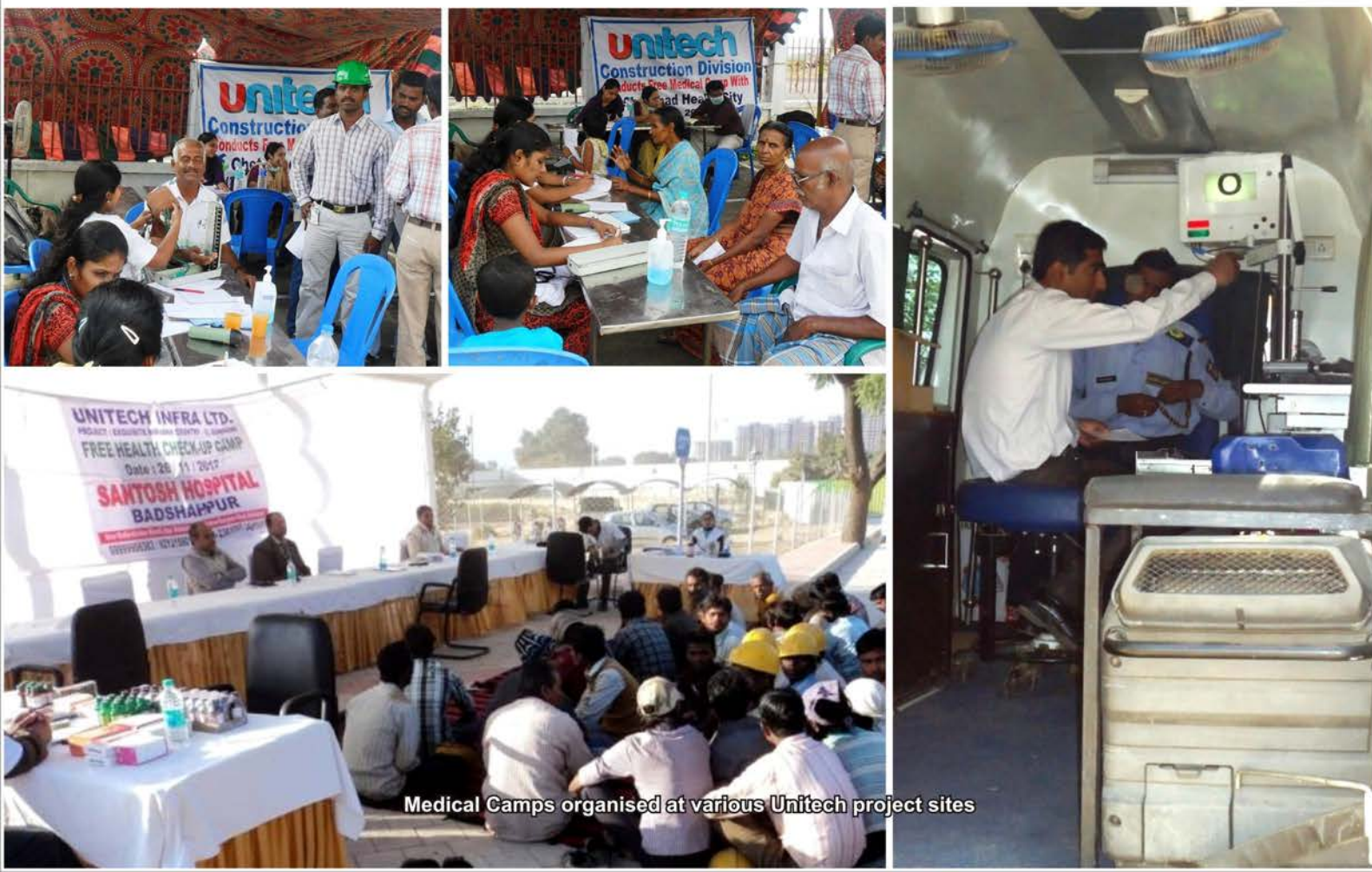
Medical Camps organised at various Unitech project sites

We have Medical Inspection Rooms at our projects to facilitate healthy living conditions for construction workers and their families at our project sites. The Medical Inspection Room has a qualified doctor who visits the sites regularly to address the medical matters.