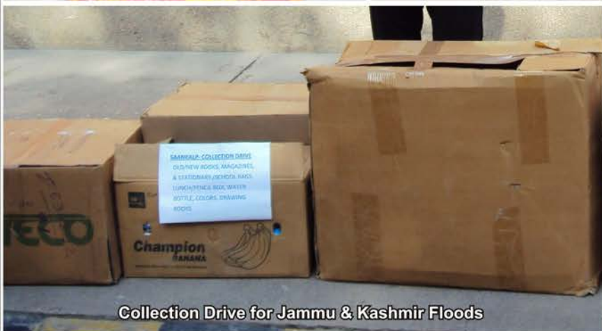
Collection Drive for Jammu & Kashmir Floods