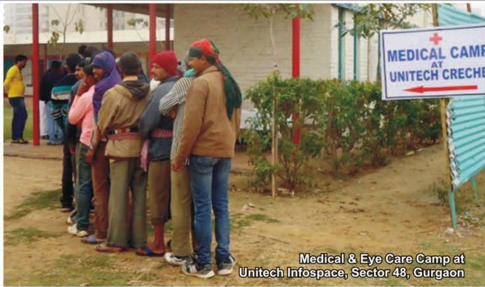
Medical & Eye Care Camp at Unitech Infospace, Sector 48, Gurgaon