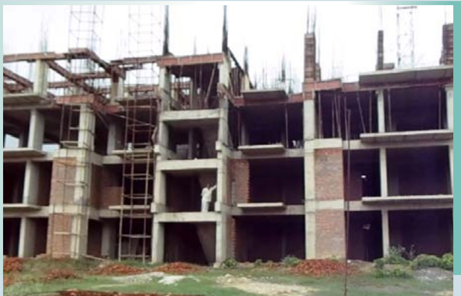
Tower A2 3rd floor roof casting in progress.