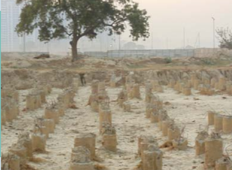
Block B Piling work completed