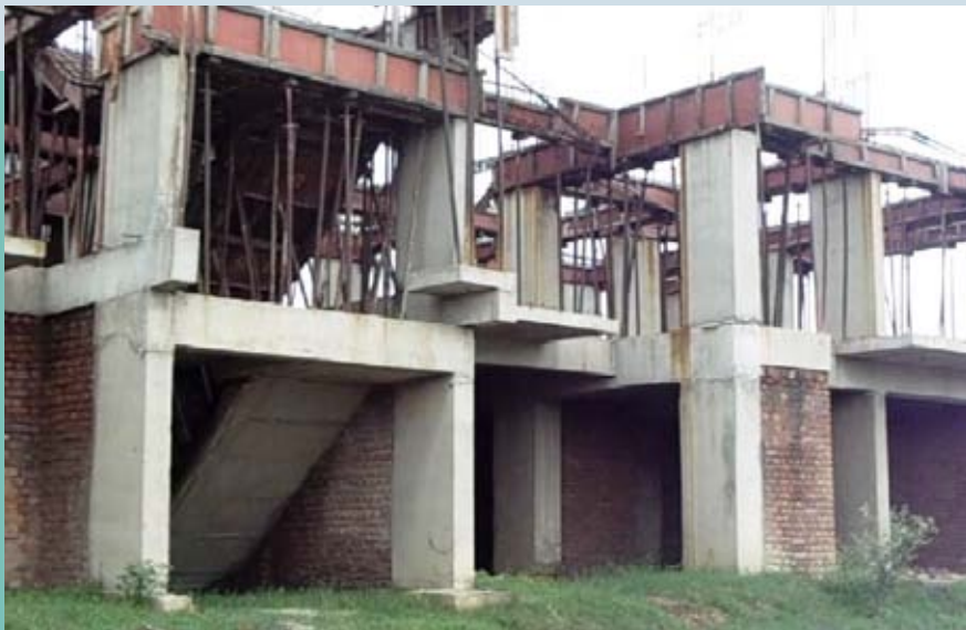
Tower A1 1st floor roof casting in progress

We would like to keep you up to date with what's happening in and around your privileged Unitech property.