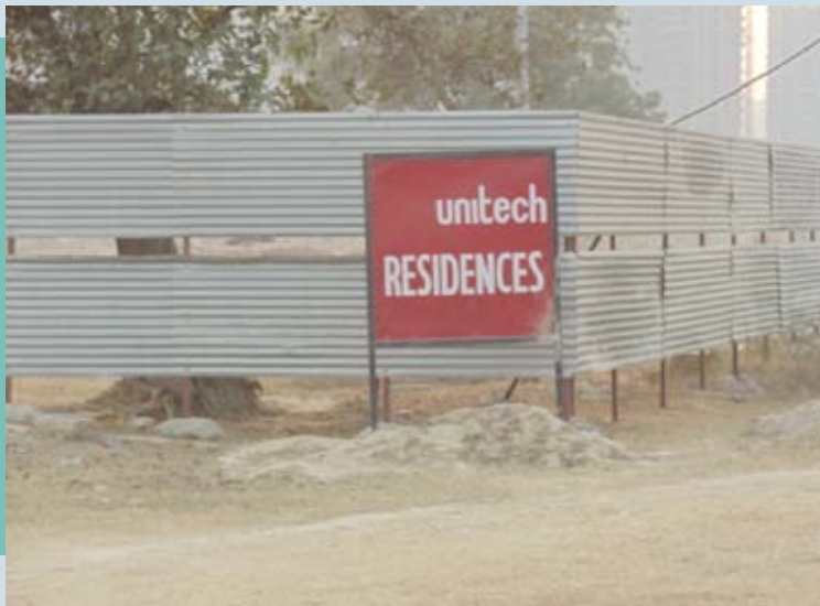
Fencing Residences Boundary Fencing

For further queries please call us at - +91 9811806864